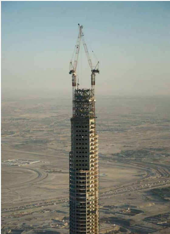
Fig. 7 Tower Cranes used in Burj Khalifa

Three primary self-climbing Favco tower cranes were located adjacent to the central core, with each continuing to various heights as required (see Fig.7). The cranes were modified to lift the extreme lengths of cables and 25 tonne payloads, at high speeds.