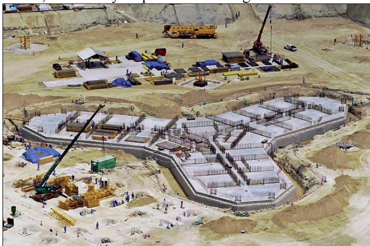
Fig. 5 The piled-raft foundation of Burj Khalifa

The construction started on 21 September 2004. The primary builder is South Korean Samsung Engineering & Construction, who also built the Taipei 101 and Petronas Twin Towers. The superstructure is supported by a large reinforced concrete raft, which is in turn supported by bored reinforced concrete piles (see Fig.5) The design was based on extensive geotechnical and seismic studies (Ref. 4). The 3.7 m thick raft was constructed in four separate pours, and is made C50 grade self-consolidating concrete (SCC). The total volume of concrete in the raft is 12,500 m 3 . The 194 numbers of bored cast-in-place piles, supporting the raft are 1.5 meter in diameter and 43 meter long. Capacity of each pile is 3000 tonnes. The piles were made high density, low permeability C60 grade SCC concrete placed by tremie method utilizing polymer slurry. A cathodic protection system was also installed under the mat, to minimize any detrimental effects of corrosive chemicals, which may be present in local ground water.