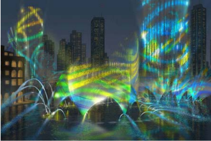
Fig.10 The water jets are illuminated by 6600 electric bulbs and 50 colored light projectors.

There is an artificial lake and a 275 m long fountain in front of the tower (see Fig.10). The fountain's jets are computer controlled and installed at a cost of US$ 220 million. This is the World's largest musical fountain, and 22,000 gallons of water will be sprayed into the air at any given time. The curtain of water can go up to 150 m high (about the height of a 50 story building) and is 250 m long.