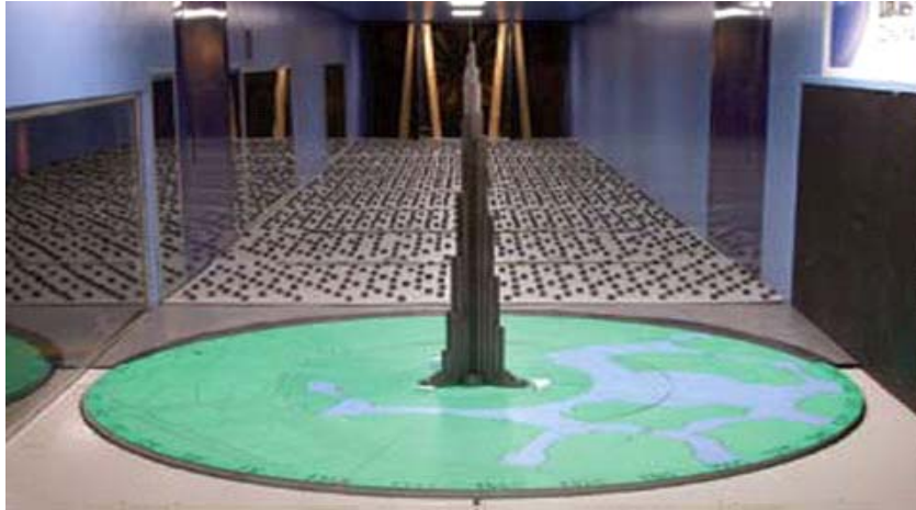
Fig. 4 Wind tunnel model at the Boundary layer wind tunnels at Guelph, Ontario, Canada