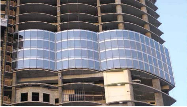
Fig. 8 High performance exterior cladding system was used to withstand the extreme temperatures during the summer months in Dubai