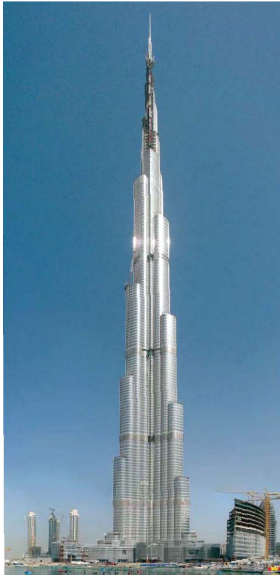
Fig. 1 A view of Burj Khalifa Project

The world's tallest building Burj Khalifa, which was under construction for six years, was inaugurated on 4 th Jan 2010 (see Fig. 1). The construction of this 828 m tall, reinforced concrete tower structure, broke several records during its construction. As it is the first time a tower of this height is attempted, a combination of several important technological concepts and innovative structural design methods were utilized in its construction. This article describes some of the features of this world's tallest tower.