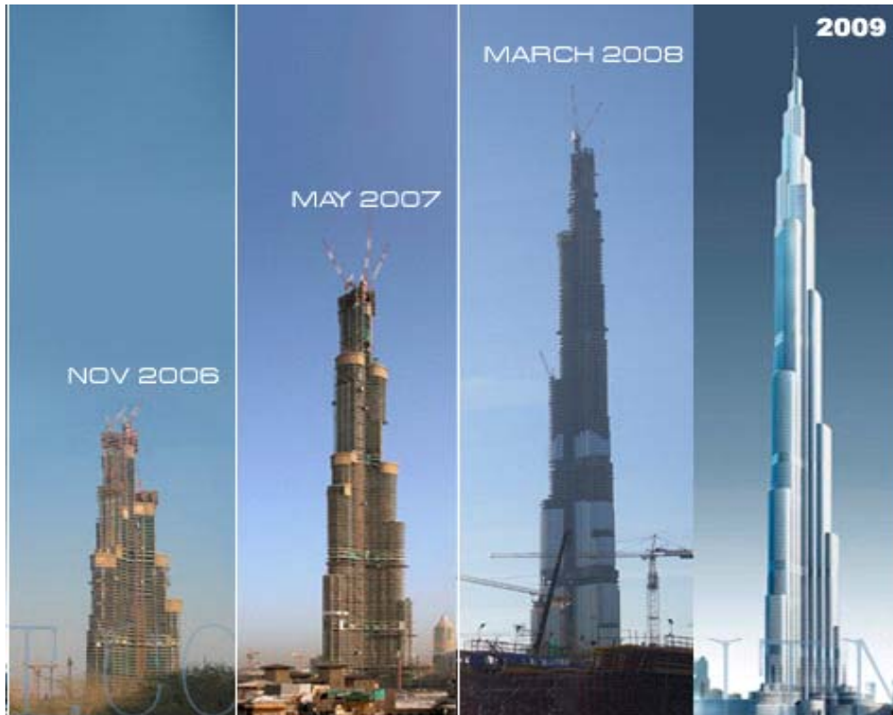
Fig. 6 Construction stages and setting records

At the peak of construction, over 12,000 workers and contractors were on site everyday, representing more than 100 nationalities. At the upper level the Earth's curvature and rotation is detectable.